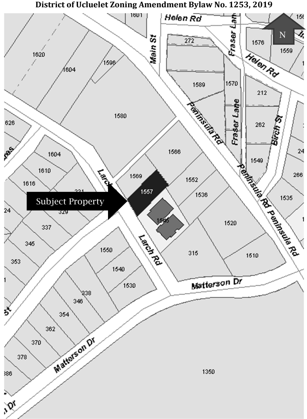
Appendix 'A' District of Ucluelet Zoning Amendment Bylaw No. 1253, 2019

District of Ucluelet Zoning Amendment Bylaw No. 1253, 2019